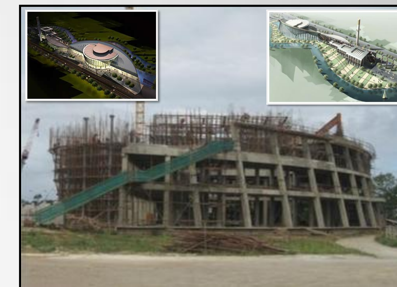
A. National Academy for the Performing Arts, South

Pictures A,B, C and D --Examples of current buildings in Trinidad which are best suited to be outfitted with the Strong Motion Instruments.