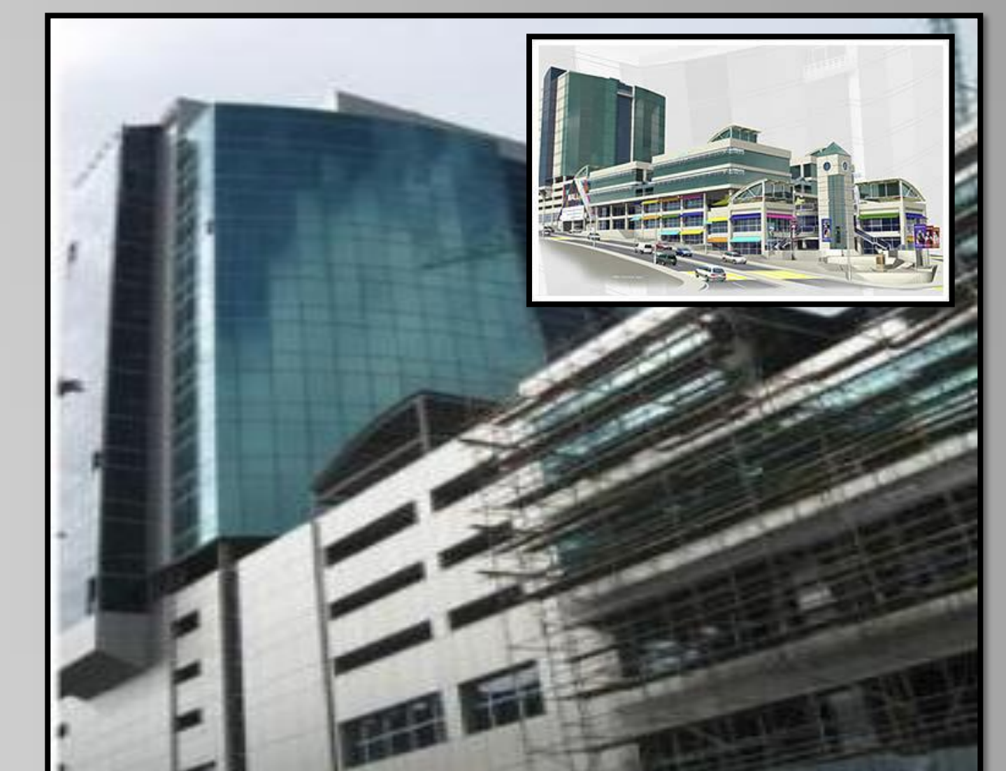
B. Chancery Lane Complex, South