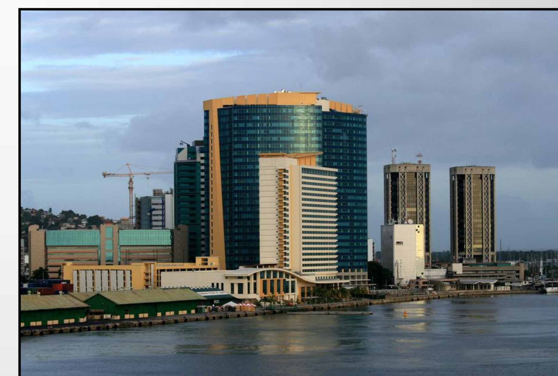
C. Water front, Port of Spain